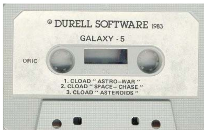
Later release with different font and only 'ORIC' on the label