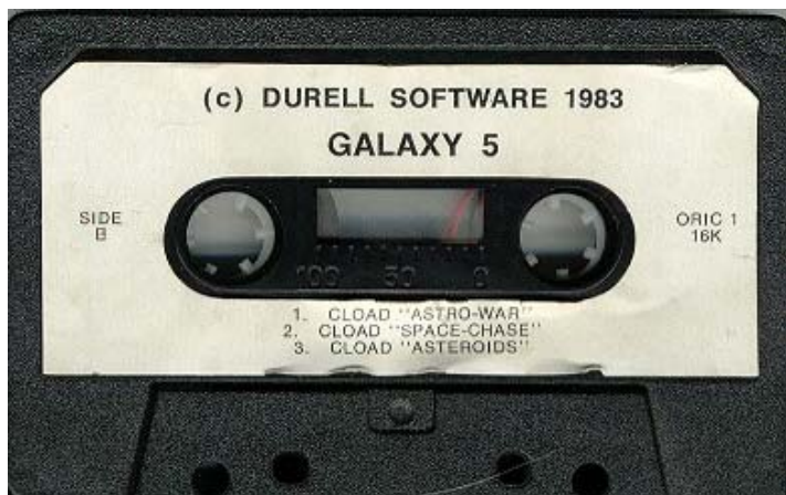
Original Galaxy 5 tape with 'ORIC 16K' to the right

The tape below left, is the original with black tape and 16K featured on the cover. On the later version the 16K isn't such a selling point so it makes it clear it is just for the Oric. Indeed most of these work on the Atmos if I remember correctly. Anyway, there you are Simon - another article !!!